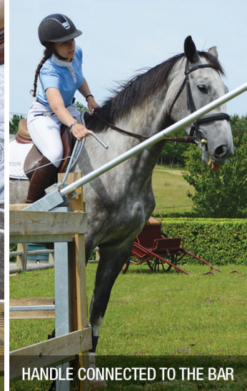
HANDLE CONNECTED TO THE BAR